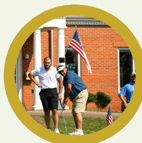
Friends of SOF Golf Scramble July 10, 2026