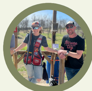
Sporting Clays Shoot May 15, 2026

Our 2026 fundraising events bring our community together to make lasting impact. By showing up, you help sustain the programs that walk alongside warriors long after the retreat ends.