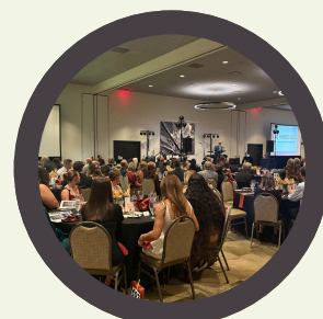
Celebration Dinner November 6, 2026